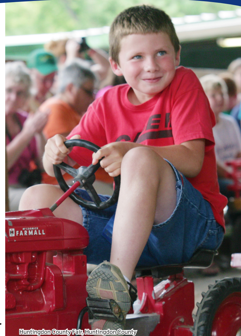
Huntingdon County Fair, Huntingdon County