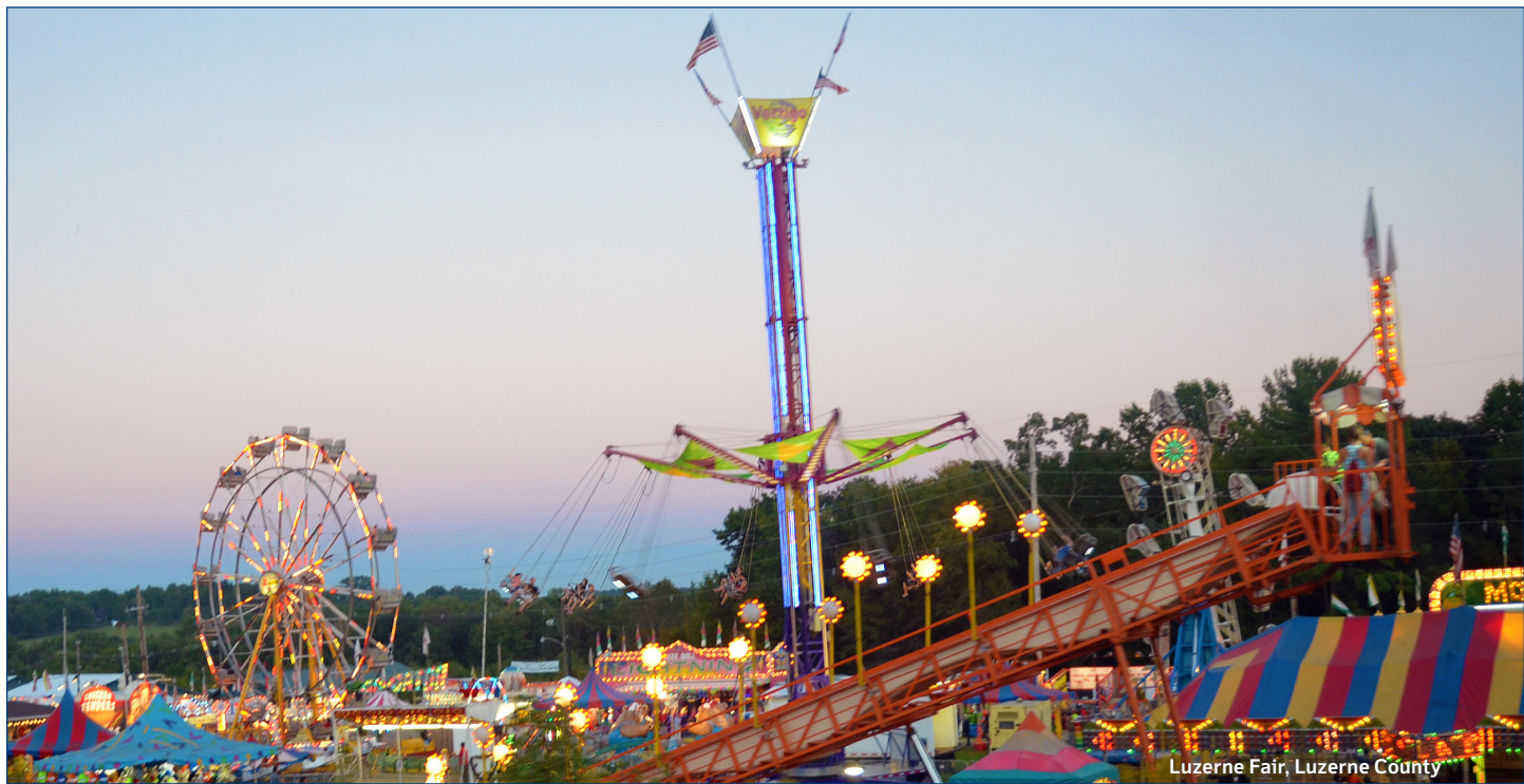
Luzerne Fair, Luzerne County